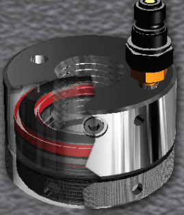
Simplified procedure. Note: for clarity the pressure hydraulic hose is not shown on the following diagrams.